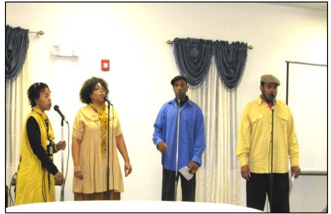
Fruits of Labor Jazz Singers

The bottom line of this struggle is this: "For the Lord your God is God of gods and Lord of lords, the great, the mighty, and the terrible God, who is not partial and takes no bribe. He executes justice for the fatherless and the widow, and loves the immigrant, giving him food and clothing. Love the stranger therefore, for you were strangers in the land of Egypt." Deuteronomy 10: 17-19 ■